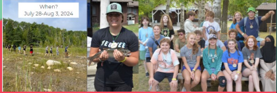
When? July 28-Aug 3, 2024